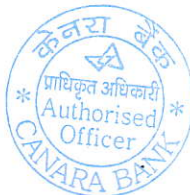
Authorized Officer CANARA BANK